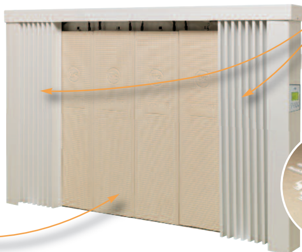
Inside - Magmatic heat retention tablets