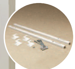
Installation kit for wall fastening