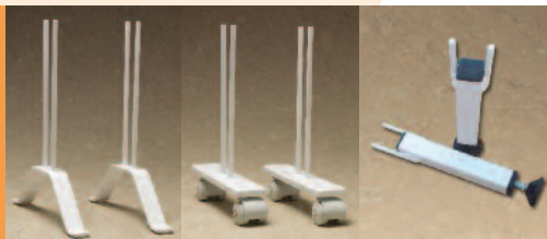
Feet Stands, Castors and Radiator Feet Supports