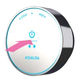
CHANGE OUTLET Push and hold for over 3 seconds and release when flow switches between outlets.