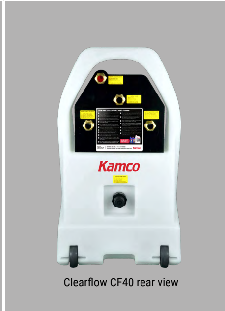
Clearflow CF40 rear view