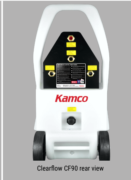
Clearflow CF90 rear view