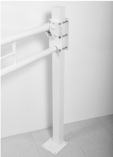
Floor mounting post