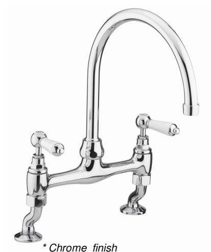
* Chrome finish