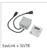
EasiLink + SLVTB