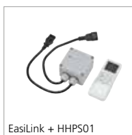
EasiLink + HHPS01