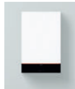
Vitodens 111-W (B1LF)