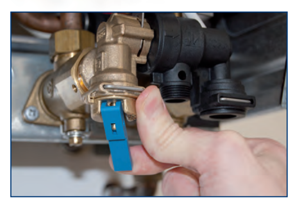
Whenever the system needs to be re-pressurised, the blue lever is simply pulled down until the correct pressure is achieved.